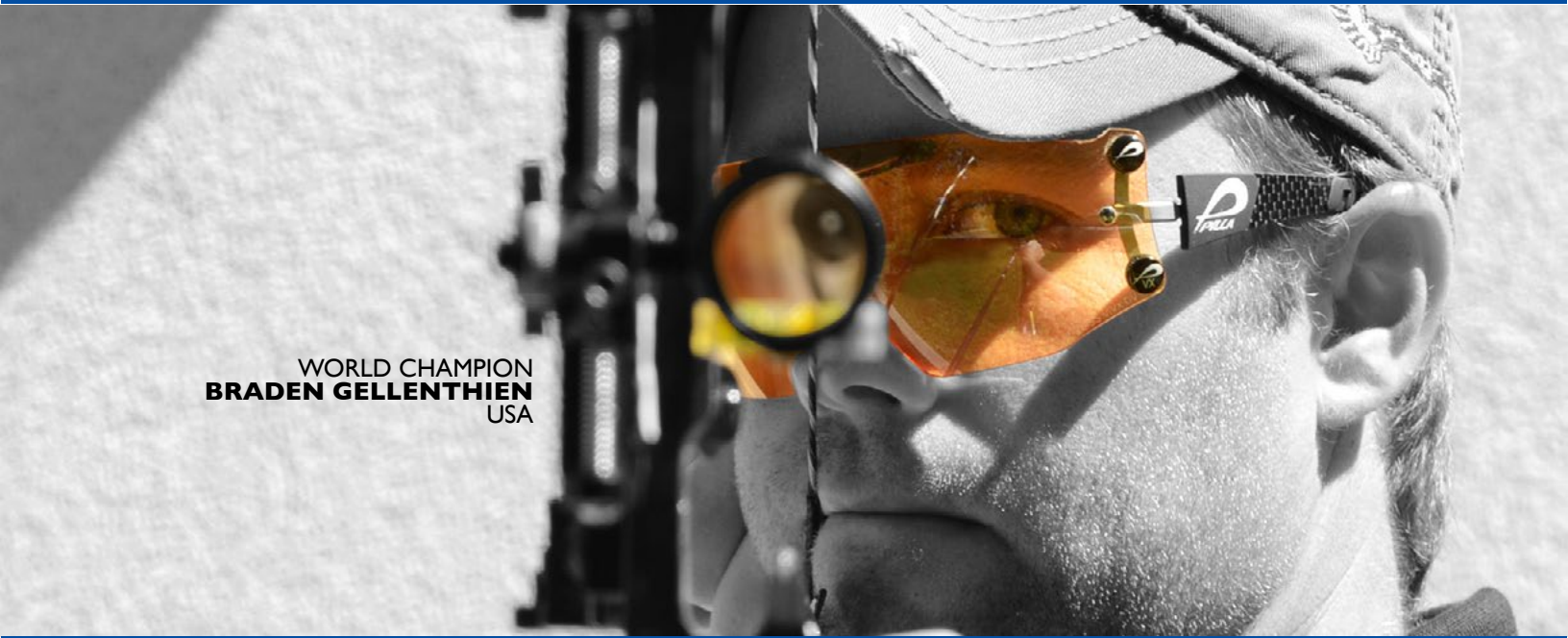
WORLD CHAMPION BRADEN GELLENTHIEN USA