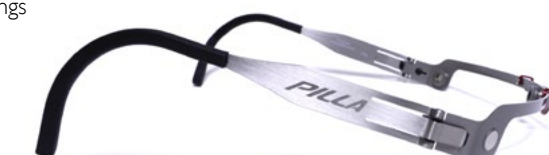
Magneto A : Cable Temple